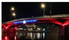
Veterans Skyway Bridge