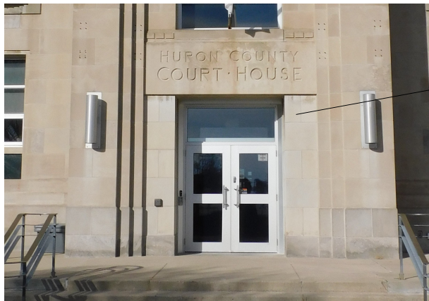
Figure 4: Typical Corner Mount Location

Wall mount should be located within the inner panel between the door and projecting pilasters, selecting a smaller stone unit and limiting damage to one stone only.