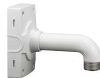
Figure 2: Dome Camera and Wall Mount