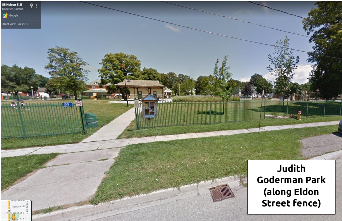
Judith Goderman Park (along Eldon Street fence)