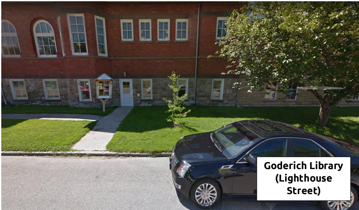
Goderich Library (Lighthouse Street)